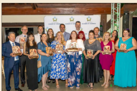
Congratulations to all the category winners!

What does Sustainability mean to Zanthorrea? With the recent acquisition of an electric tractor, Zanthorrea now has all on site vehicles and gardening tools powered by batteries. Our water is all collected and used a second time on our botanical gardens. Power comes from the sun thanks to 54 solar panels, with plans to remove reliance to the grid with a large battery backup system. Zanthorrea is an advocate for low fertiliser and chemical use, encouraging climate friendly plant choices and greening our urban areas. We can all help to be a part of a sustainable future. - Ross