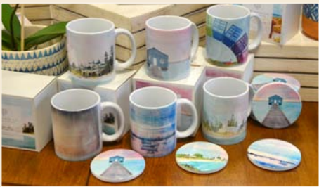
Braw Paper Co Mugs

Relax after all your hard work and enjoy a bath with these superb smelling bath bombs, salts, body scrubs and soaps from Soapmaid. Hand made in Melbourne they also make a fabulous gift!