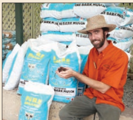
Fletch with mulch

The best mulch is one with nice chunky pieces that will create a thick blanket over your topsoil. This will help suppress weeds and minimise water evaporation, but will still let the soil breathe and allow the water to travel down to the root zone. It's best applied at 50mm thickness. Chunky pinebark is a great mulch because it has big and little pieces that will mulch well and start to break down into your soil. It also comes from plantation timber. How sustainable is that? – Fletch