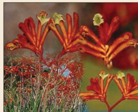
Anigozanthos ‘Federation Flame’

At last there are some ‘Federation Flame’ ‘roo paws. These paws developed by Kings Park have not been available commercially. This is an orange form of Anigozanthos rufus, a southern plains kangaroo paw with a branching flower stalk to 1m. ‘Federation Flame’ can tolerate a wider range of positions and can be planted in amongst other shrubs in a watered garden, with flowers in spring and early summer.