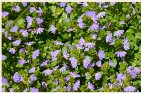
Scaevola 'Crinkle Cut'

Although we know it's best to plant in autumn, many gardeners – myself included – cannot resist the temptation to plant over summer. There are so many beautiful summer flowering plants in the garden centre. We briefly forget about the harsh dry conditions our plants will have to endure for the next few months.