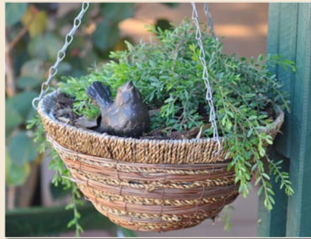
Acacia 'Green Wave' in a hanging basket.

If you want to maximise the number of plants in your patio area, you may want to consider hanging baskets or growing vertically with trellis or topiary.