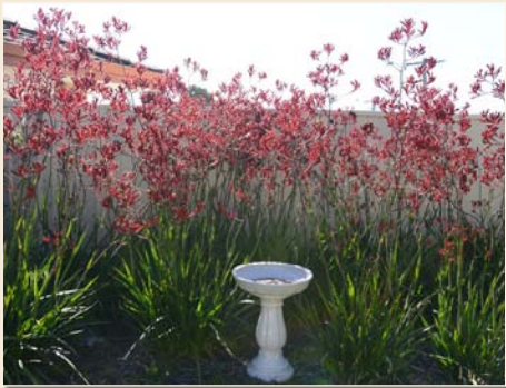
Anigozanthos 'Big Red', en masse.

The best way to attract birds to your garden is with grevilleas, kangaroo paws and bottlebrush. Here are some of my favourite bird attractors: Callistemon 'Little John', Grevillea 'New Blood', Grevillea 'Robyn Gordon' and Anigozanthos Big Red.