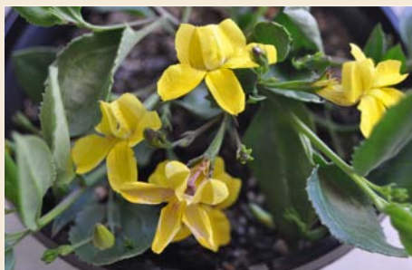
Goodenia 'Gold Cover'