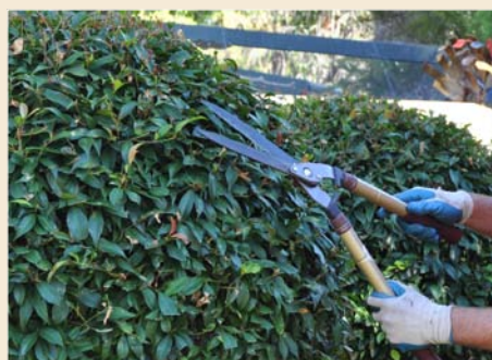
An example of pruning.

When planting in summer, it is recommended that plants are watered each day for a few weeks while the weather is hot and dry. Gradually as your plant becomes established, watering may be reduced to a good deep soak twice a week. Use your finger to check for soil moisture to avoid overwatering. A well-designed reticulation system will make it easier to keep the plants hydrated.