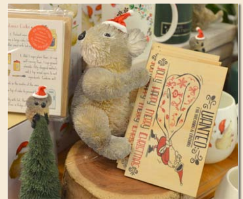
Hanging Christmas Koalas, $19.95 by Bristlebrush Designs Australia.

Come and browse our fun collection of Australian Christmas decorations and homewares. Leave a cookie and some milk for Santa on his cute mug and saucer set by Ashdene Australia. Two designs to choose from: Singing Koalas or Christmas Wombats. $29.95 each.