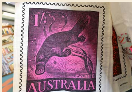
Statement Tea Towels by Russel Leonard.

A family owned business, The "Pure Oils of Tasmania" range was created in conjunction with Gardening Australia presenter Angus Stewart. With the aim of sustainably using some of the Tasmania's beautifully fragrant and therapeutic plant essences. The range includes pure essential oils of Manuka, Kunzea, Tasmanian Blue Gum and Lavendar Tea Tree. Each of these essences are also used to create an aromatic spritzer and luxurious nourishing cream. Beautifully presented in timber-look gift packaging. Essential Oils $32.95. Nourishing Cream $29.95. Aromatic Spritzer $27.95.