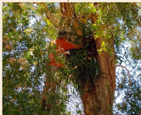
Alec installing the Elk Horn.

A new release from the Wildflower Plantation is this stunning Chamelaucium hybrid 'Cluster'. Flowering winter to spring with large clusters of bright pink flowers at the end of the stems. Great for your own vase flower arrangements. First batch to be available shortly in 140mm pots. Plant now to enjoy the flowers next year.