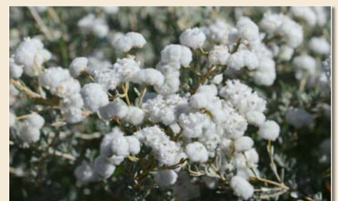
The sun loving Dicrasyllis globiflora are also ready for sale and looking good.

The toothed or trailing guinea flower is one we don't commonly have at our garden centre. Currently we have a nice batch in 140mm pots. They are striking plants with their bright yellow flowers and dark glossy foliage. They are a non vigorous climber, or more often grown as a ground cover. They make an excellent hanging basket or container plant. Find a spot with afternoon or dappled shade.