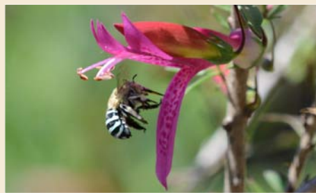
The Blue Banded Bee (native to this area) are out and about at the moment. Here it is on an Eremophila.

When you visit, just mention you are on our mailing list (no vouchers required this year). Additional calendars may be purchased at $7.95.