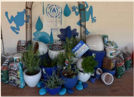
A selection of waterwise plants and products.

The best time to help your garden become waterwise is at the time of planting, as you can improve the soil and choose waterwise plants. Saying that, it is not too late to make some adjustments to help your garden be more waterwise and survive summer.