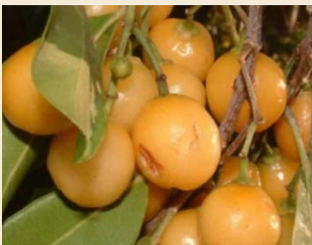
Fraser Island Apple

This is a very useful plant indeed. They have edible dark berries, and the leaves and flowers can be made into a medicinal tea. This tea is said to have anti viral and anti bacterial properties and has also been used for some cancer treatments.