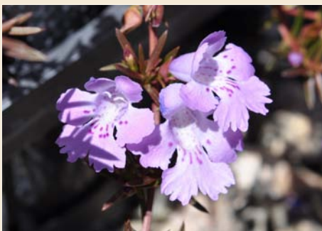
Summer flowering Hemiandra pungens .