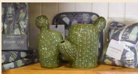
Cactus prints and cactus vases.

Red Tractor has some awesome condiments to match the quirky quotes on mugs, plates and cards. They have also produced some rainfall charts, zingy lemon scented gum soap and candles that smell just like walking under a lemon scented gum. From $7.45.