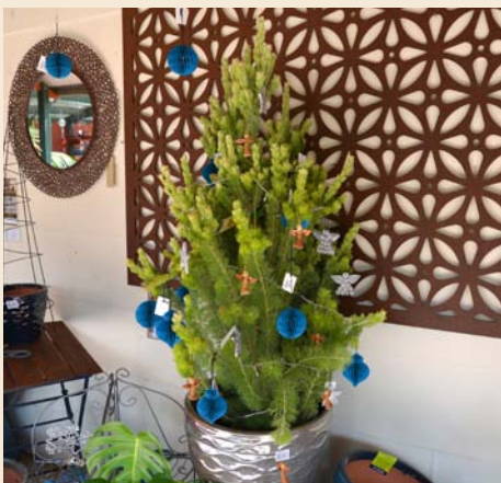
Albany Woolly Bush as a Christmas Tree