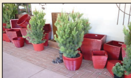
Albany woolly bush as a Christmas tree

The Backyard Patio, often forgotten over rainy winter months is a great place to entertain family and friends. Coming into summer is the best time to spruce it up and have it looking great for the festive season. Here are a few ideas: