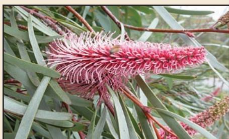
Waterwise Hakea francisiana

The old fashioned trickle feed with micro-tube take offs were very effective for slow delivery but had a habit of blocking up and needed checking now and then. Adjustable drippers are less prone to blockage but put the water on at a faster rate, so soil wettability needs to be better. Sub-surface drippers are great, with a feeder every 30cm and if installed properly are trouble free. This is the system we are moving towards for watering our display gardens and will soon have them all watered this way. Though they are called sub-surface we put them on the surface and cover with mulch.