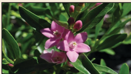
Crowea 'Poorinda Ecstasy'

Crowea 'Poorinda Ecstasy' - This Summer flowering Crowea is great in part shade, but will also adapt to full sun. The pink flowers are a pretty addition to any garden and they stay a manageable size of between 1-1.5m. Pruning increases bushiness.