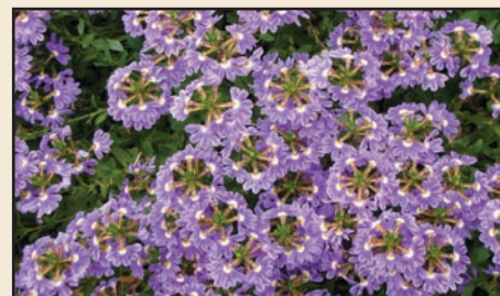
Scaevola 'Purple Fanfare'

If you have the Poly roofing that cuts out the sun by 50% then you can grow almost any plant on the patio in a pot. A couple to try in either pots or hanging baskets: Scaevola 'Purple Fanfare' and Grevillea 'Mt Tamboritha' .