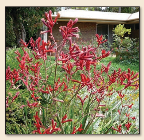
Anigozanthos 'Big Red'

This month's POM is the beautiful, bird attracting Anigozanthos 'Big Red' . This hardy, easy to grow 'roo paw flowers all summer with blooms reaching as high as 2 metres. Plant on mass for a dramatic effect.