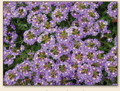
Scaevola 'Purple Fanfare'