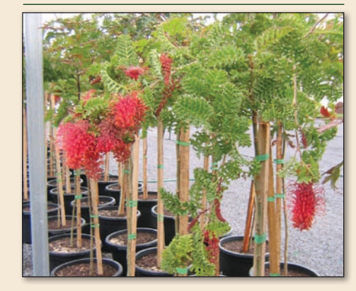
Grevillea bipinnatifida standard

A few are becoming available by mid December, grown locally by accredited wholesale grower Domus Nursery. Varieties include Grevillea bipinnatifida and G. Royal Mantle' and will sell at $175.