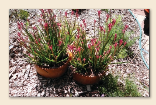
all year. Try some in a pot!

Our first batch of Anigozanthos 'Bush Dance' is now selling. They have proved reliable for us and we cross our fingers and hope they will be for you. Bright red and green flowers to 30cms, flowering now and supposed to flower off and on