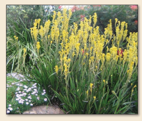
Anigozanthos 'Bush Gold'

These are the ones to use for long term satisfaction! Anigozanthos 'Big Red', 'Yellow Gem', 'Cross of Gold', 'Bush Gold' are reliable in most gardens.