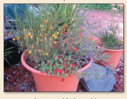
Kathy's potted lechenaultias

Add a selection of your favourite small native plants to suit the pot size, water in well, stand back and admire. Aus plants in pots still require summer water, but less than you would give petunias and roses. (I do mine every 2nd or 3rd day in summer, and rarely in winter.)