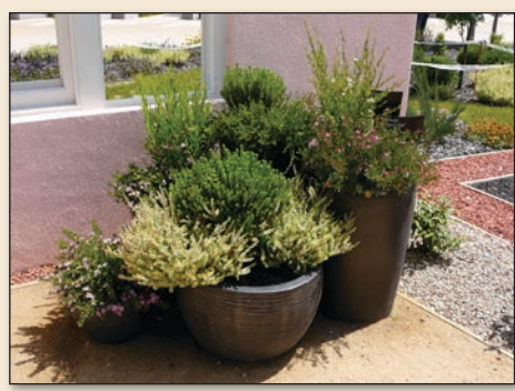
Potted garden, Australian style

It's easy to pretty up the patio this summer using beautiful Australian plants. In place of petunias and miniature roses, consider using rock daisies or kangaroo paws. Not only are Australian plants hardy with few if any pests and diseases, they are unique and add an Aussie look to your outdoor entertaining area.