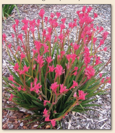
Anigozanthos 'Bush Pearl'

This year's allocation of Anigozanthos 'Bush Diamond' from the grower to us was only 20 plants - all pre-booked. Our own tube allocation won't arrived in WA until late autumn for spring sales. 'Bush Diamond' is not a bright flower, just different being almost white on the head with a slight pinkish tinge. We hope it follows the beautiful 'Bush Pearl' in being fairly hardy.