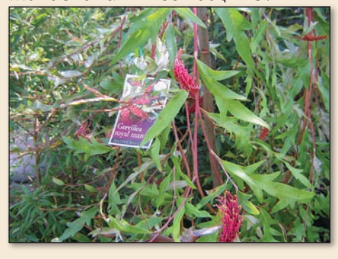
Grevillea 'Royal Mantle' standard

A few are becoming available by mid December, grown locally by accredited wholesale grower Domus Nursery. Varieties include Grevillea bipinnatifida and G. Royal Mantle' and will sell at $175.