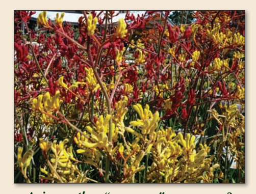
Anigozanthos "en masse" – see page 3