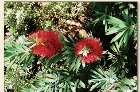
Callistemon 'Little John'

Callistemon 'Little John' flowers on and off most of the year, but looks fabulous now with dark red flowers and blue- green foliage.