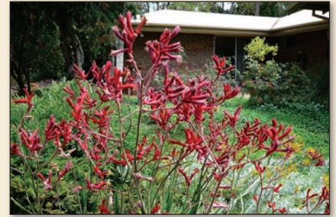
Anigozanthos 'Big Red'

Always stunning in summer are the tall summer flowering 'roo paws: Anigozanthos 'Big Red' , 'Yellow Gem' and 'Orange Cross'. These beauties suit sun or shade, garden bed or pot, and can survive on barely a drop of water.