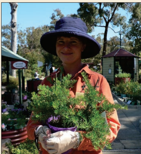
Kathy: Grevillea crithmifolia "Greener than grass in summer, with no water after the first summer"