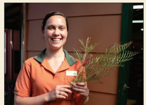
Bri: Grevillea 'Red Hooks' "Great foliage, good screening plant"