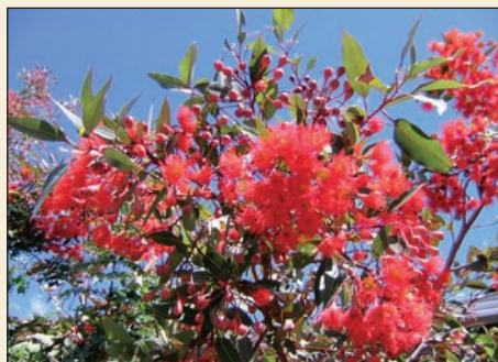
Eucalyptus ficifolia - flowering now