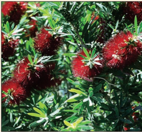
Callistemon 'Little John'

This month the Kanyana plant is the ever popular Callistemon 'Little John'. Little John is a very small form of Callistemon viminalis with greyish leaves, compact habit to 1m in 7 years, easily pruned to a 50cm hedge with a smattering of cerise red flowers most of the year, peaking about now (early summer).