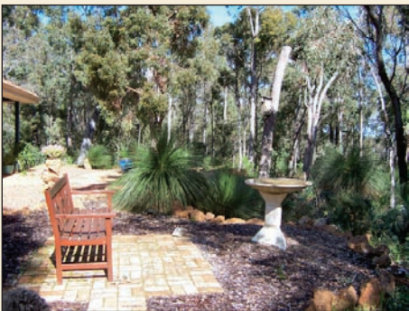
From the garden of Nissa Aked

Thank you to the gardeners who sent in photos to inspire other gardens. Check the display in the shop.