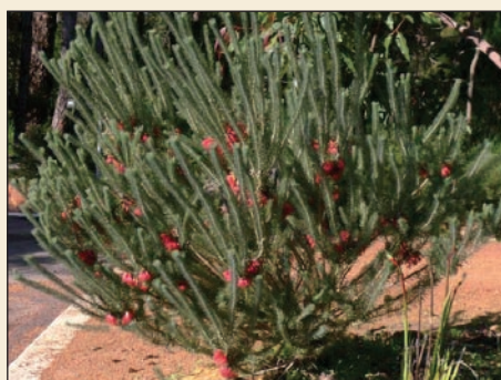
Alec: Calothamnus quadrifidus "Reliable coast to cap-rock, favoured by birds"