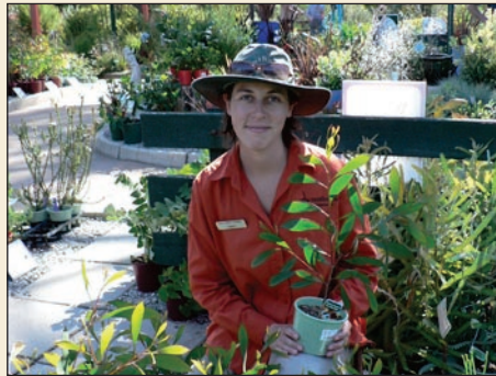
Gaby: Hakea laurina "Gorgeous flowers for the birds"

The following plants were selected as favourite waterwise champions by the team. Their criteria: no watering required once established... after two or three summers with once or twice a week watering.