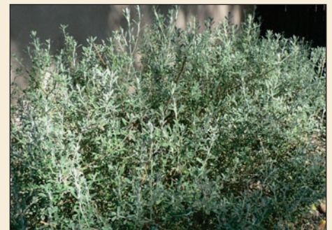
Dan: Olearia axillaris "Smells nice, brilliant silver foliage"