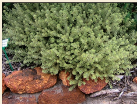
Claire: Westringia "Morning Light" "Suits both old fashioned and ultra modern gardens!"