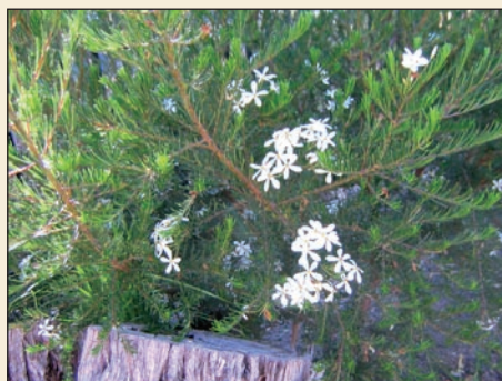
Jackie: Ricinocarpus tuberculatus "Showy, cooling white flowers on deep green foliage"