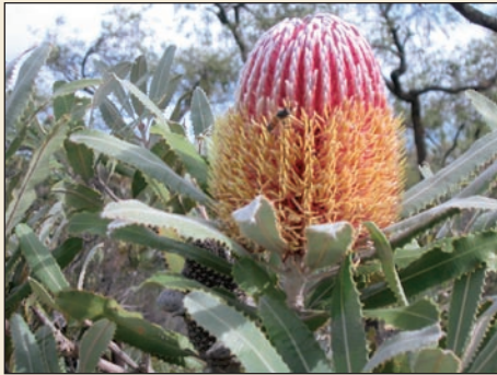
Sue: Banksia menziesii Dwarf "Fast and dependable with pink shoots, classic flowers and funky nuts"