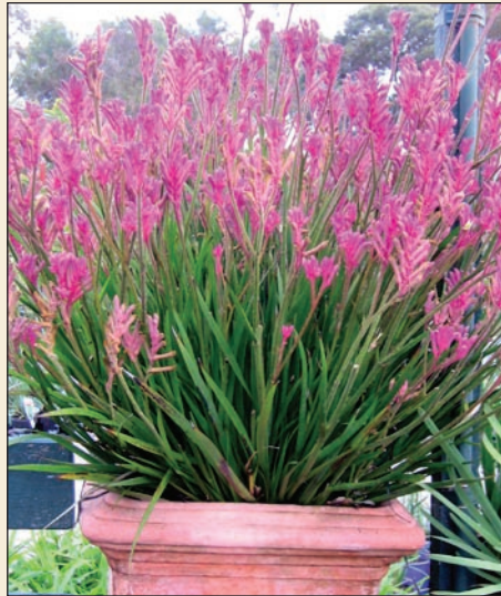
Anigozanthos 'Bush Pearl'

It is surprising to find that many Australian plants are perfect for growing in pots. In fact some will grow better in pots that they do in our hot dry gardens.