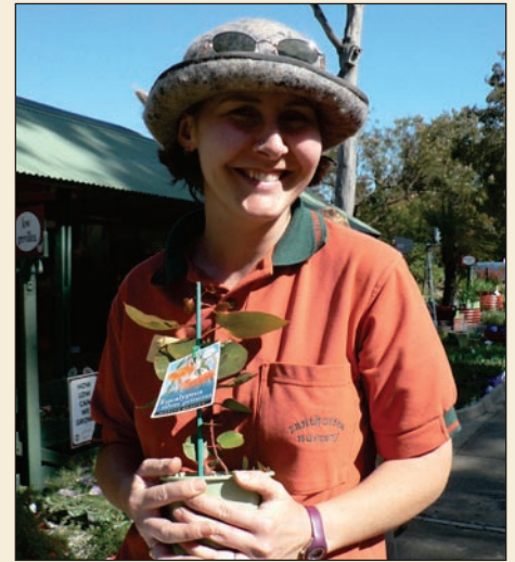
Laurel: Eucalyptus caesia "Graceful, pendulous waterwise feature"