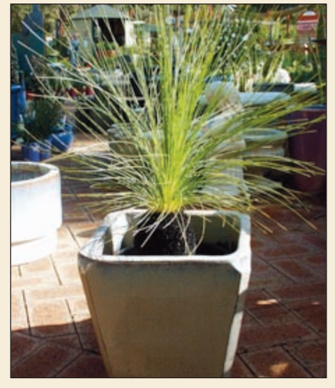
Xanthorrhoea johnsonii in Cache Pot

Cache, a french word, refers to something which is hidden from view, or put away. Use pots without a drainage hole to hold a treasured plant still in its plastic pot. Stones in the base of the pot will prevent waterlogging, and stones or bark chips on the surface of the potting mix will hide the fact that the plant is simply resting here a while.