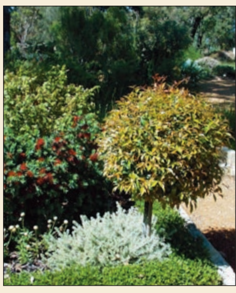
Formal Display Gardens

To our surprise, there are now four more eggs in the box, which should hatch in late November. Call in and see the action live on the Birdcam monitor in the nursery shop.