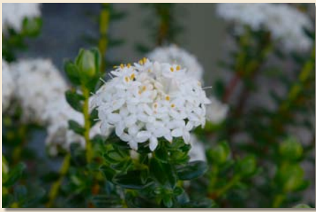
Pimelea 'White Solitaire'

Spring brings with it a new 'Plant of the Month' where $1 from the purchase of every plant will be donated to Kanyana Wildlife Rehabilitation centre. This month's plant is the Pimelea 'White Solitaire'. This compact shrub makes a mass of white flowers. Try mixing it up with some pink Pimelea ferruginea for a spring sensation!