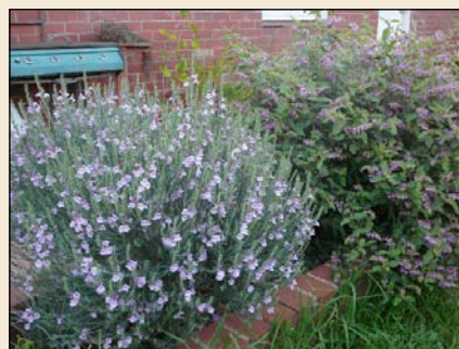
Thomasia purpurea and Eremophila microtheca in Danielle's garden.