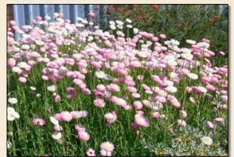
Everlastings in Muriel's Garden

Day off so it's out into my garden. Took a stroll out there, with coffee cup in hand and did a count of different flowers out now. 80!! Can you believe? Its just your average size suburban block down on the sandplains but with varying heights and lots of little plants (there's always room for one more!) I have my own little wildflower display.