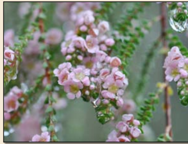
Thryptomene 'Pink Lace'

At this time of year, I always think what good value the thryptomene are for their extended winter flowering. My favourite would have to be Thryptomene saxicola 'Pink Lace' which starts in early June and goes through into September. The Thryptomene saxicola 'Mingenew' is close behind followed by Thryptomene 'FC Payne'.