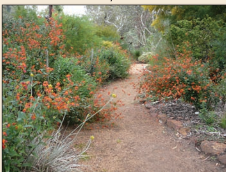
Chorizema cordatum along path

PS: Our new 125mm compostible pots are NOT to be planted with the plant. The plant is carefully removed from the pot and planted with soil improver, before the organic pots is crushed and composted.