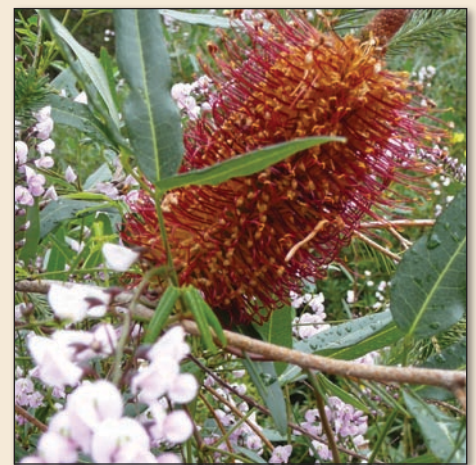
Hardenbergia and Banksia ericifolia

Eucalyptus preissiana (bell fruited mallee) up near the brushwood fence is only 2m high but has lots of big yellow blooms this year. As a mallee it can be cut down to any size you want and will make 3m in 20 years if you don't prune!