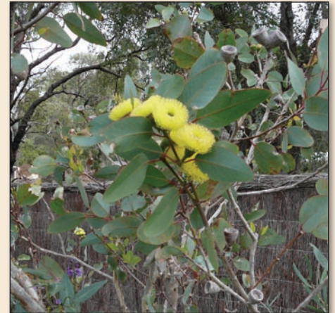
Eucalyptus preissiana in flower

Chorizema cordatum (heart leaf flame pea). The bright orangy red flowers are all through the gardens. Each plant only lives 10+ years, but they re-seed well and ours are all re-seeds now. We leave them to grow unless they are totally in the wrong place.