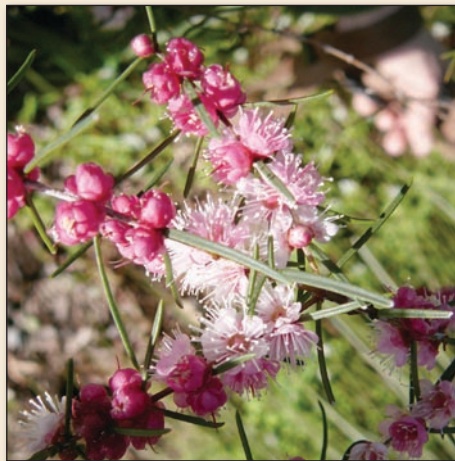
Hypocalymma 'Coconut Ice'