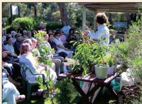
Gazebo garden talks

We can assist in the conservation effort by purchasing a Wollemi Pine and becoming part of the most dramatic comeback in natural history.