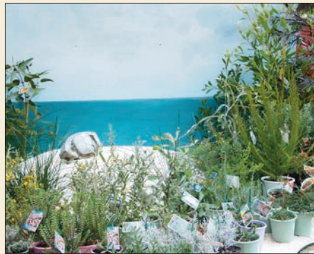
Drought hardy coastal plants

At Zanthorrea, we welcome the opportunity to help you save precious water in your garden.