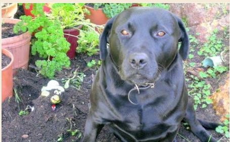
Guinness with the buried gnome.