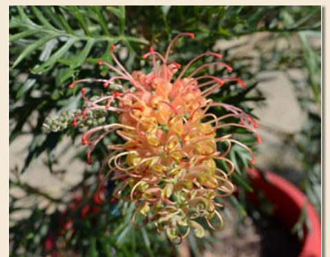
Grevillea 'Loopy Lou'