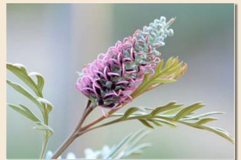
Grevillea 'Dorothy Gordon'

It is a great time to get potatoes into the garden. Improve the soil with plenty of organic material and manure and watch them grow. You can build up the soil around the stem to produce extra potatoes. Harvest when the plants have died off.