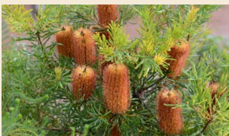
Banksia 'Honey Pots', welcoming autumn with wonderful flowers.