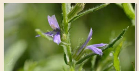
New to Zanthorrea from the north of WA: Stemodia sp Onslow.