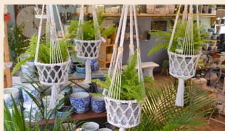
Hanging plants for the indoors or patio.

Coconut and Tahitian Lime, Ligurian honey and Blood orange, Wild bushland Eucalyptus. $38.95.