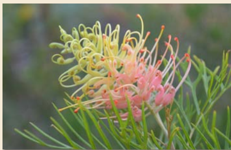
Grevillea 'Peaches and Cream'