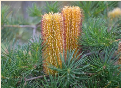
Banksia 'Cherry Candles'