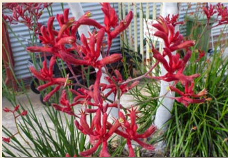
Anigozanthos 'Big Red'

are now available including our WA emblem ( Anigozanthos manglesii ), the black paw ( Macropidia fuliginosa ), our favourites 'Big Red' and 'Yellow Gem' and some of the hardier 'Bush Gem' range. – Alec