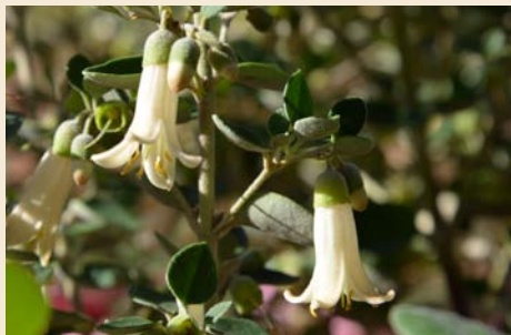
Correa 'Winter Bells'

Autumn is a great season of colour and change. The rains bring out the colours of the native wildflowers. Here are some of the autumn flowering plants that are guaranteed to brighten the autumn garden: