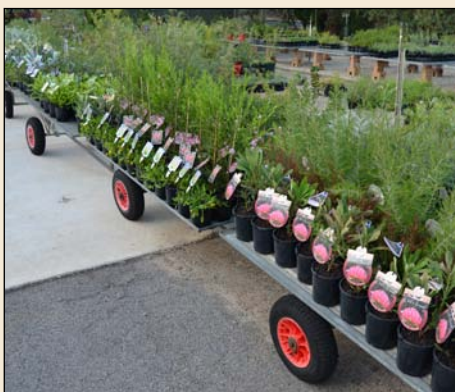
Beautiful new plants from our friends in Mount Gambier