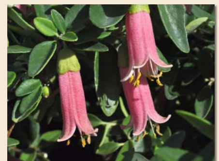
Correa 'Dusky Bells'