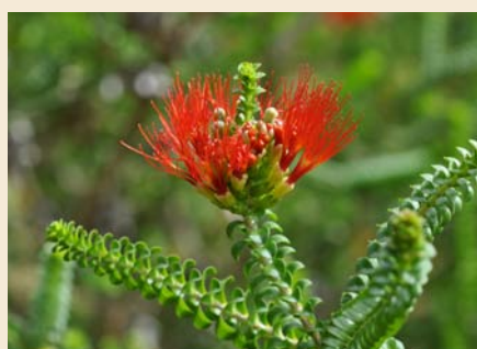
Beaufortia aestiva 'Summer Flame'

Another drought hardy plant for WA conditions, this shrub grows to around 1.2m in any soil. The striking mauve pom-pom flowers appear in mid winter through to early spring. 140mm pot $12.95