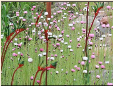
Everlastings and Red and Green Roo Paws