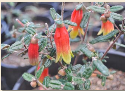
Correa 'Fat Fred'