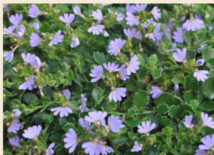
Scaevola 'Crinkle Cut'