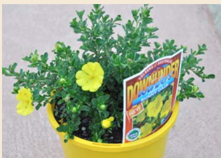
Hibbertia 'Sunny Daze'