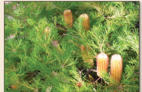
Banksia 'Birthday Candles'

limited number of unusual species available too. The ever popular Banksia 'Birthday Candles' is also in stock and is a great addition to the garden.