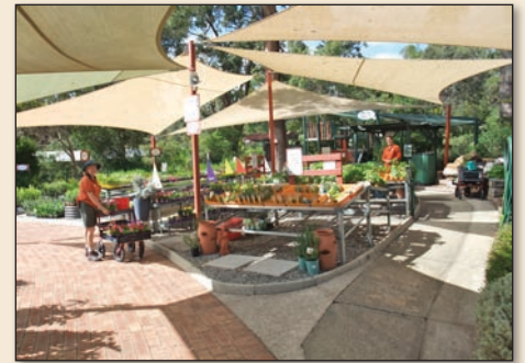
Diana and Alix under the new seedling shade sails

Our seedlings and herbs are even happier and healthier under the new shade sails.