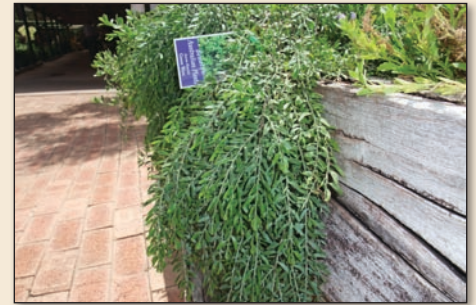
Acacia howittii 'Green Wave'

This year we will have a very good range of Banksias available. They are among my favourite group of plants and late autumn/winter is the best time to plant them. As well as the usual favourites, we will have a