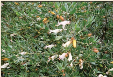
Eremophila 'Peaches and Cream'

Peaches and Cream ( Eremophila racemosa ) , this 1m bright green bush gives yellow and white buds and flowers from winter to summer.