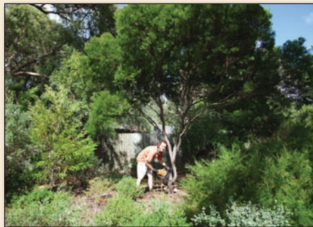
Chris making a single tree out of an old Acacia fimbriata dwarf

Autumn is also a great time to tidy the garden and prune. Chris has been busy in our display gardens.