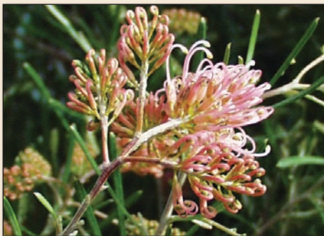
Grevillea 'Frosty Pink'

As always, Grevilleas have a strong presence at Zanthorrea in the autumn. Excellent performers available include 'Superb', which flowers almost all year; 'Red Hooks', which is an excellent tall screening shrub with bold toothbrush type flowers and 'Frosty Pink', which is an Alec favourite that is low growing, hardy and floriferous. Old reliables G. crithmifolia and 'Winpara Gold' are in good numbers and are great for verge planting and screening/hedging respectively.