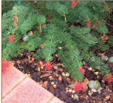
Grevillea 'Gilt Dragon'