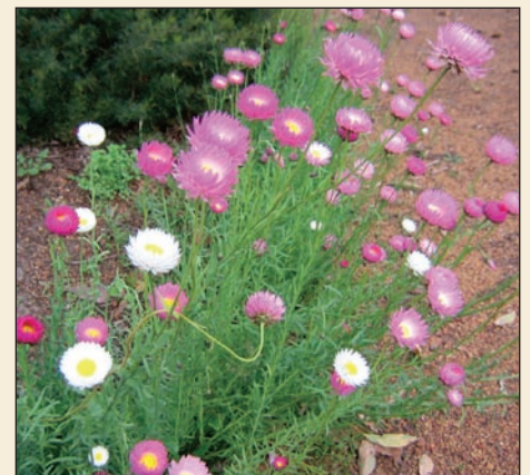
Everlastings in flower

By the time the lovely pink and white everlastings are flowering, it may be too late to plant seed. The seeds germinate in autumn and early winter, growing on through winter to flower early spring. Once the weather warms up, these annuals set seed and are finished for the year.