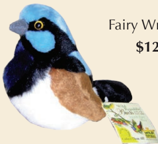
Fairy Wren, $12.95

No birds? The singing birds are back! Press their middle and they sing. A great gift for Easter.