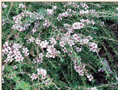
Leptospermum 'Pink Cascade'