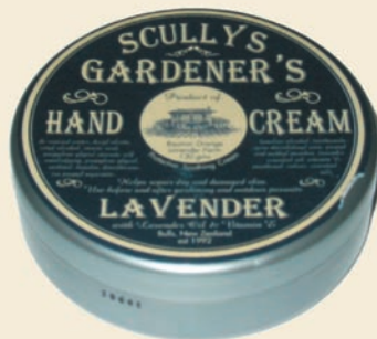
My favourite! $14.95

A fabulous cream to use before and after gardening. Made in NZ from the best ingredients, and imported due to very popular demand.