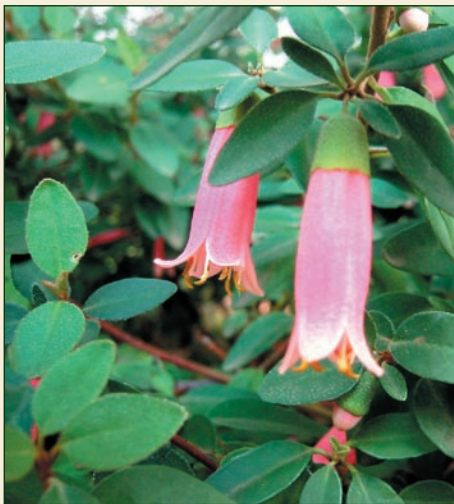
Correa 'Dusky Bells'

Native fuchsias come in many shapes and sizes, and look dramatic in the autumn. Look for pink 'Dusky Bells', apricot C. pulchella , red C. reflexa and green (yes! green) C. bauerlinii or Chefs cap correa.