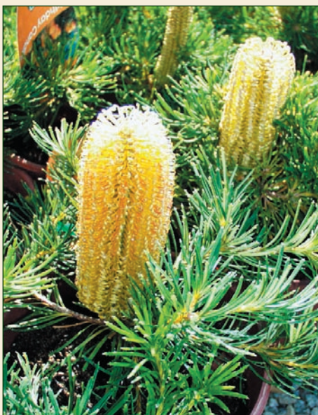
Banksia 'Birthday Candles'

A compact form of Banksia spinulosa , this wonderful small plant is in flower now with large golden candle flowers. Perfect in a large pot with masses of blooms to bring in the birds.