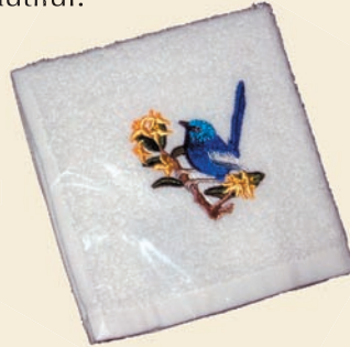
Blue wren face cloth $9.95

Mums of all ages will love this range of embroidered linen. Owned and made in Australia, they are useful as well as beautiful.