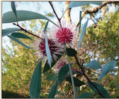
Flowers of the Hakea laurina