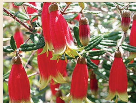
Correa 'Fat Fred'

From our accredited production area we have some nice little Correa 'Fat Fred'. As easy to grow as most correas , 'Fat Fred' has a bright red fat bell flower in autumn and winter. They grow over knee high and will flower even in fairly heavy shade.