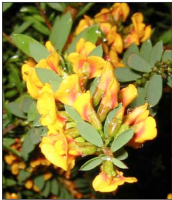
Bacon and Eggs (Eutaxia obovata)