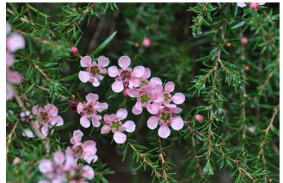
Leptospermum 'Pink Cascade'